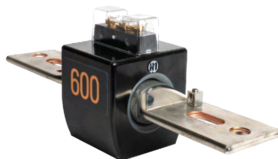
ABB CBT-S, Artech IRH-1, GE JCT-0S, GEC Durham Type TCB, Ritz DCAW/DCAB