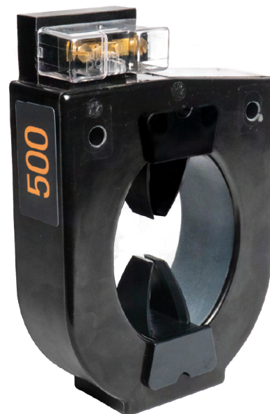
ABB CMV-S, Artech IRH-7, GE JAB-0S, GEC Durham Type AP, Ritz DCDW